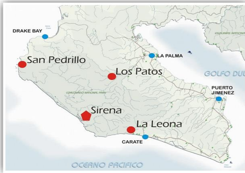
Corcovado National Park ranger stations including Sirena Station in the heart of the protected area.