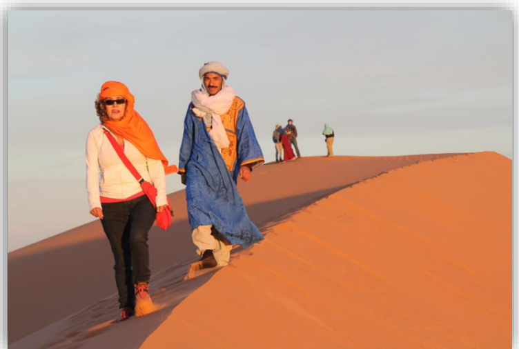
Sunset and sunrise camel rides and hikes in the dunes of the Sahara with local Tuareg guides is real Moroccan adventure.

After a cold drink and a delicious dinner, retire on carpets and pillows around the fire under a vast star-lit desert sky to ponder the imponderable, and to marvel at the comfort of your private well-appointed tent with mattress beds, linens, towels, pillows and Berber rugs