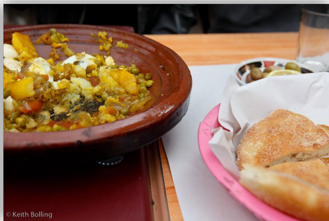
Enjoy a diverse array of Moroccan specialties in cafes, restaurants and local homes.

Head east to the next 'Imperial City' of Meknes. With its famous gate of Bab El Mansour, the impressive Dar Jamai Palace, the Royal Stables, and the tomb of Moulay Ismail; this lesser-visited city is worthy of a dedicated visit because the brutal and ambitious sultan turned Meknes into a royal city, aiming at challenging Versailles with enormous palace grounds. Due north lies Volubilis, a UNESCO World Heritage Site and Morocco's largest and best-preserved Roman ruins of colonnaded streets, buildings, and elaborate mosaics. Off in a short distance stop to absorb the beauty and special ambiance of the cobbled streets of Moulay Idriss -- a sacred city named after fourth generation and sainted descendant of Mohamed, the founder of Islam in Morocco and founder of the city of Fez -- your final 'Imperial City' where a scrumptious Moroccan feast is served. Overnight local Fez riad . [BD] (Drive 3 hrs)