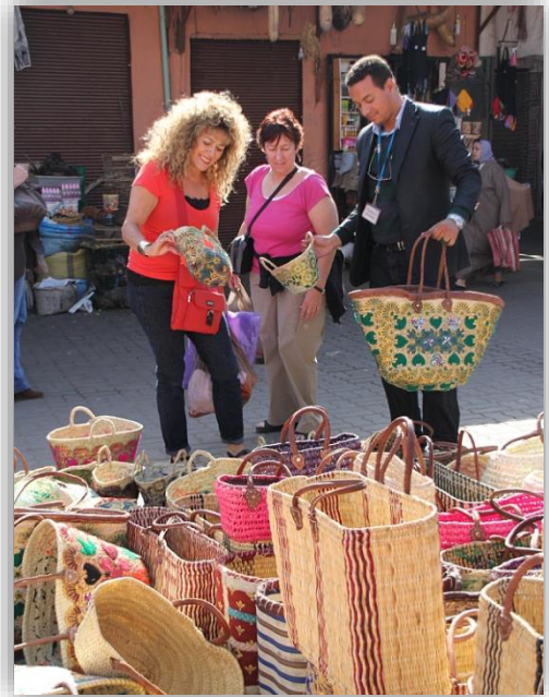
Picking up souvenirs in the Marrakech souk