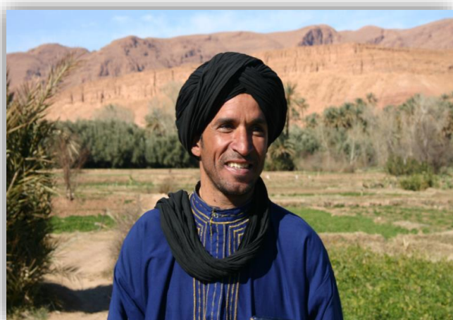
Local village leaders escort us through their communities and into the maze of passageways in old Kasbahs

Arise early for a morning walk to see the start of the day and the colors of the sunrise on the red soils and glowing walls of the kasbahs. Down the road stop at Ait Ben Haddou, once a fortified ksar and now a UNESCO World Heritage Site, the setting for many desert films including Lawrence of Arabia and more recently, Gladiator with Russell Crow. After a brief exploration of this popular site you walk through to the lesser known and more impressive area of Telouet, center of the former Glaoui family who ruled over the south of Morocco before they were overthrown by the current monarchy. The road to Marrakesh ascends over the High Atlas Mountains on a sinuous route with spectacular views over Tizi-n-Tickka (7,417 ft) -- the highest pass in Morocco. Descending on the other side into the foothills the landscape turns green with