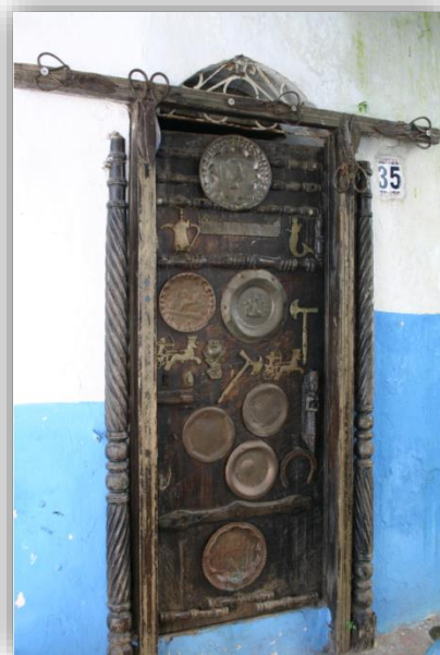
Front door of a local home in Oudayas Kasbah quarters.

Note: Your sightseeing itinerary en route to Rabat is tailored to your international flight arrival time in Casablanca. Direct flights from Europe to Rabat eliminate the 2.5 hour transfer to Casablanca.