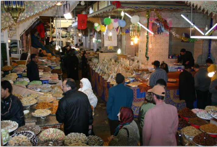
The markets in Morocco reflect the ancient culture, traditions and modern daily life.

you have the chance to visit Qaraouine University, the Madrassa (Quranic school), and the Moulay Idriss II memorial, all windows into local life, education, and religion. Lunch in a local restaurant in the medina is an immersion into the world of Moroccan spices, olives, and specialty dishes. For those who have an extra day to explore Fez, we can arrange a cooking session to learn about preparing delicious Moroccan cuisine: whether it be couscous, tagine (meat stew), and traditional Moroccan soup called harira. Overnight local Fez Riad. [BL]