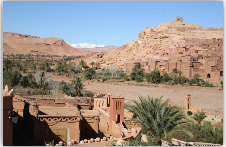
The best way to experience the history and daily life in the Valley of the Kasbahs is hiking in palmeries, villages and fields

This is an exciting day from dunes to desert and hikes to villages and Ksar fortresses in the Valley of Kasbahs. Awaken before dawn to saddle your camel for a short ride through the dunes to watch the sun rise over the desert horizon. The true solitude and beauty of the Sahara reveals itself only in such moments. Depart camp in 4x4 for a beautiful day exploring the farms, villages, and traditional homes through the Valley of Kasbahs. In the town of Tinjedad you walk through part of a Ksar, a surreal roofed village of eighty families living in a complex maze of adobe streets and housing, including the small Berber museum of El Khorbat recounting the story of the indigenous tribes of the region. You'll have an opportunity to stretch your legs and get a feeling for daily life on a two to three-hour easy hike in the picturesque irrigated palmerie of the Dades Valley where families tend to their crops. After lunch at a favorite local restaurant our route approaches Klaat Mgouna, where in springtime the valley is filled with the dusky pink of the Damascus rose, their essence prized by the elite of French perfumers. The best activity at the end of the day in our hidden garden oasis is no activity at all! Relax and enjoy this serene environs and lovely room in this restored Berber-style accommodation among the palm plantations and olive groves. Overnight Jardins de Skoura or Dades Kasbah . [BD] (Drive 6 hrs)