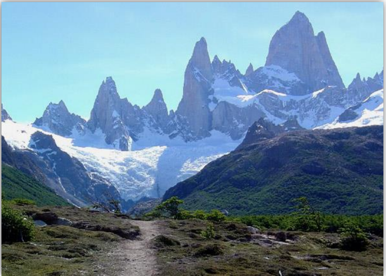
Mt Fitzroy, El Chaltén